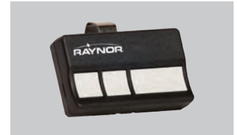
3 Button Transmitter