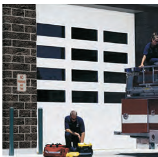
TC Series™, TC300

Raynor also offers a full line of sectional, rolling, fire, high performance and traffic doors, as well as, security grilles. See your Raynor Dealer or visit www.raynor.com for more information.