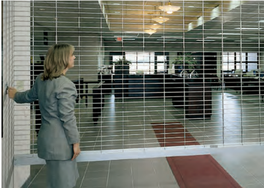
DuraGrille Straight Pattern