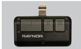
3 Button Transmitter