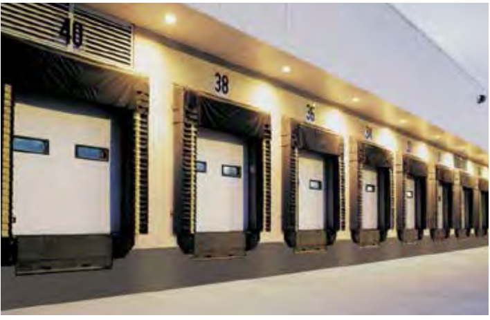
TC300, White with Rectangle Windows

Designed for optimum strength and performance, this door's 20-gauge exterior steel skin and rugged hardware provides the ultimate in dependability. Raynor TC320 is ideal in applications where security and thermal protection are required.